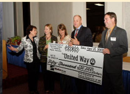
Premay employees contributed $50,000 to United Way for 2006